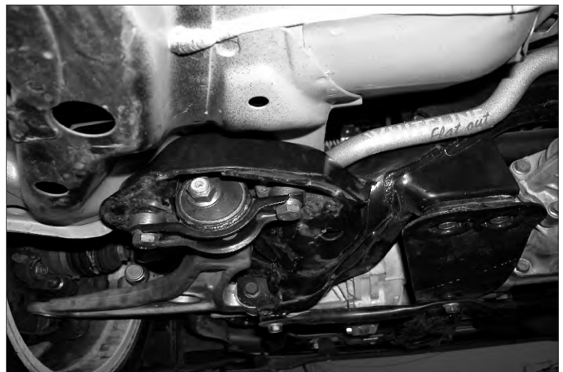
Fig. 3 - Note RHS, offset bushing installed for caster gain.