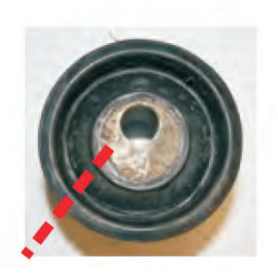
Offset - W93403

It can be difficult to identify which rear mounted differential kit (W93403 or W93408) you require to do the job. You certainly don't want to get it wrong, so an easy way to accurately determine what you need is by the orientation of the factory bushing through bolt as per below.