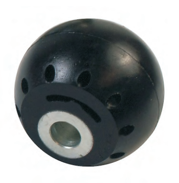
W93403 Differential rear mount Falcon BA/ BF SX/SY Territory 75mm OD

The front mounted bushings boast patented bushing designs, doing away with the traditional steel cased bushing with a dual durometer bushing that does not require the use of a press to install. Thats right install by hand with no compromise on bushing strength or performance!!!