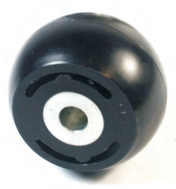
W93408 Differential rear mount Falcon BF/ FG SX/SY Territory 89mm OD