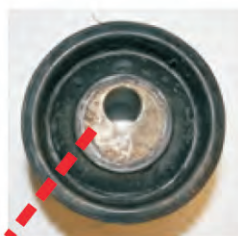
Offset - W93403

It can be difficult to identify which rear mounted differential kit (W93403 or W93408) you require to do the job. You certainly don't want to get it wrong, so an easy way to accurately determine what you need is by the orientation of the factory bushing through bolt as per below.