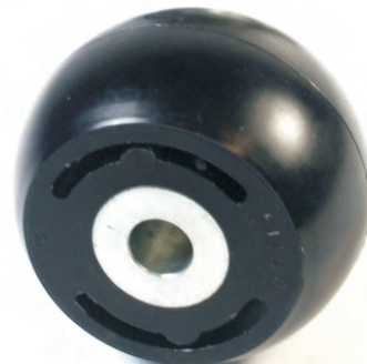
W93408 Differential rear mount Falcon BF/ FG SX/SY Territory 89mm OD