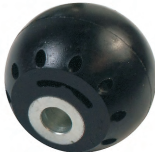
W93403 Differential rear mount Falcon BA/ BF SX/SY Territory 75mm OD

The front mounted bushings boast patented bushing designs, doing away with the traditional steel cased bushing with a dual durometer bushing that does not require the use of a press to install. Thats right install by hand with no compromise on bushing strength or performance!!!